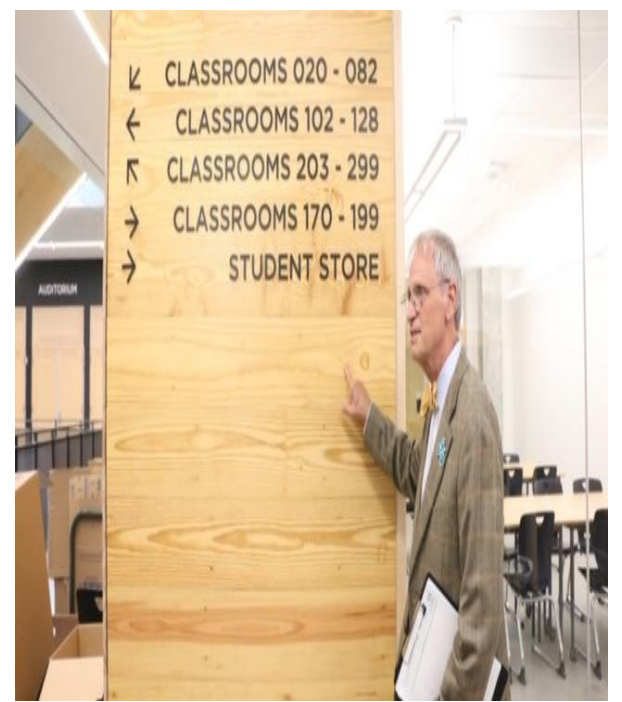
U.S. Representative Earl Blumenauer visits the Grant campus.